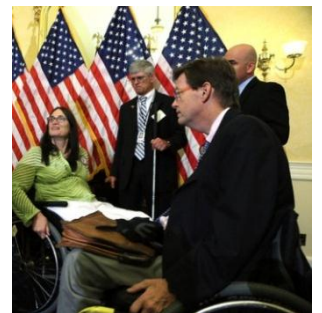
VSO Press Conference on CRPD

• 22 veterans service organizations including Veterans of Foreign Wars, the American Legion, Disabled American Veterans, and Wounded Warrior Project support ratification of the CRPD. These groups recognize that our 5.5 million American veterans with disabilities will have greater opportunities to work, study, and travel abroad as countries implement the CRPD with leadership from the U.S.